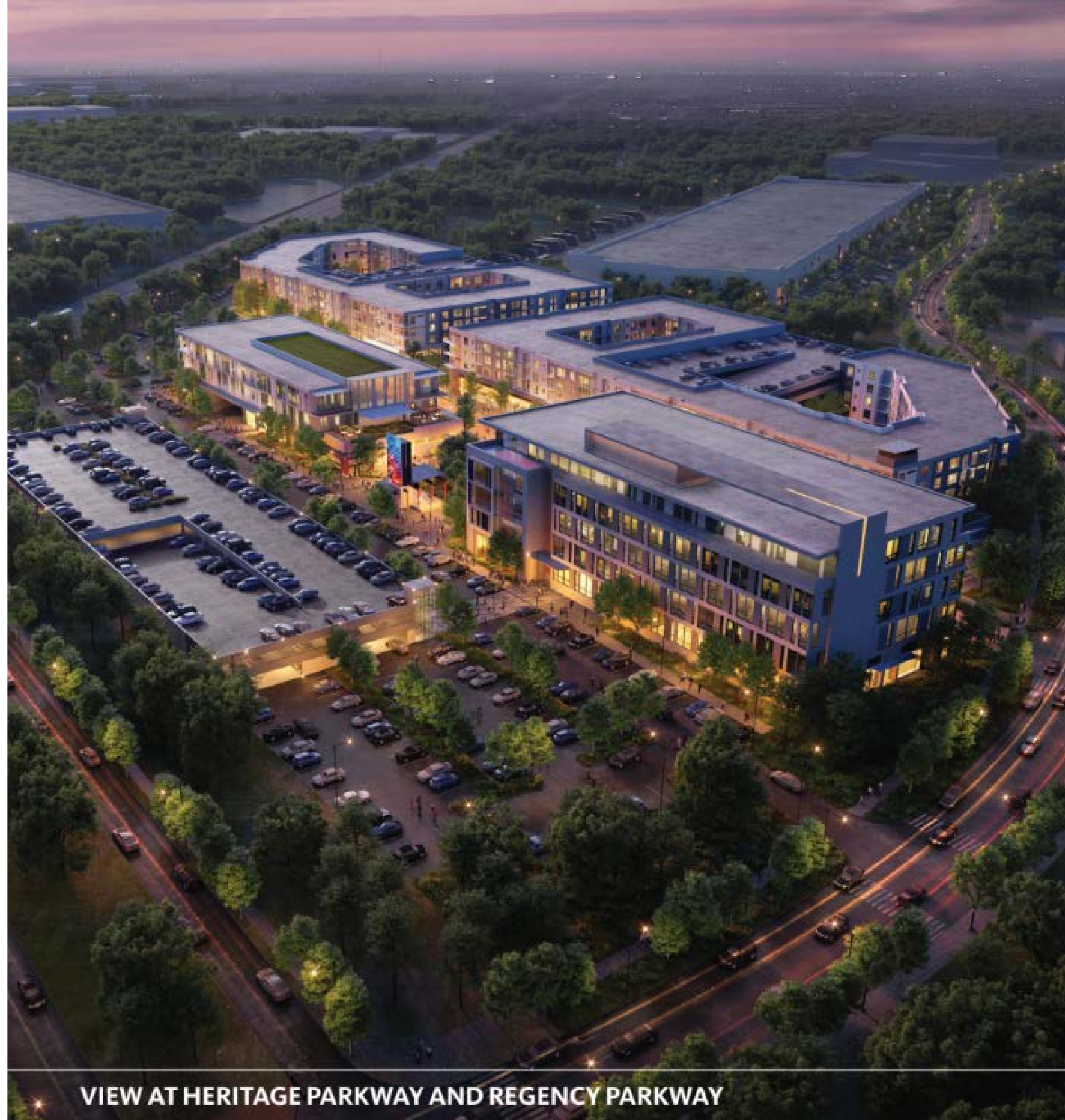
VIEW AT HERITAGE PARKWAY AND REGENCY PARKWAY