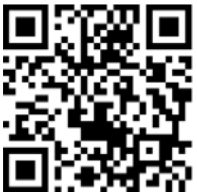
The LinQ Innovation Website

See "Mansfield on the Rise" for additional details, along with photos and renderings.