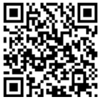
Staybolt Street Brand Book